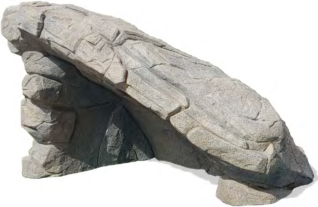
3 Cave Rock CB011 (Rock Type: Granite)